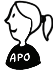
AREA PRODUCT OWNER